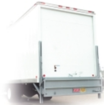
RailTuck Model in "stored" position