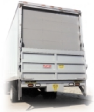
Standard Model in "stored" position

Provides long life with greater reliability than cable drive.