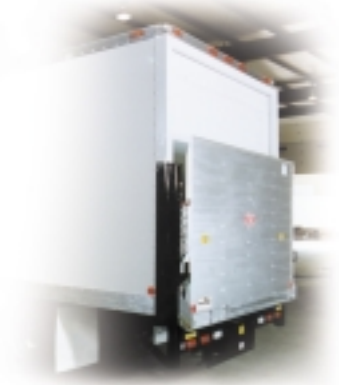
Optional aluminum platform