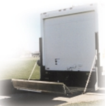
Optional retention ramp