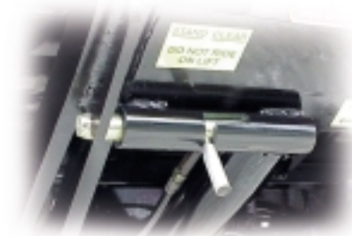
Easy access and highly visible, heavy-duty Latch Pin Assembly positively secures gate in closed position. This Anthony standard feature is the strongest and most visible latch in the industry