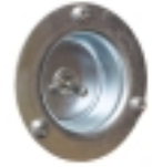
Recessed Toggle Switch (optional)