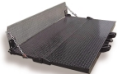
Optional 80" x 42" + 12" Steel Platform with 12" Aluminum Retention Ramp