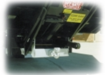
Optional 5-ton Pintle Hook Bracket