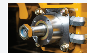
Heavy-Duty Parker TG280 Wheel Motors