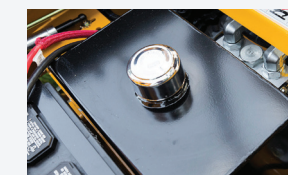
Large Oil Reservoir