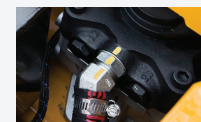
Industrial-Grade Slipper Piston Pumps