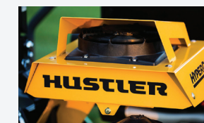
9" Fan & High-Capacity Oil Cooler with Hot Oil Shuttle

Increase the life and performance of your mower with Hustler's exclusive HyperDrive system, the largest, most durable drive system in the industry. With temperature regulation and heavy-duty components, HyperDrive will keep you operating at peak performance.