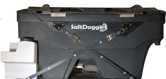
Spreader sold separately

• Includes tie downs and corrosion resistant stainless steel brackets.