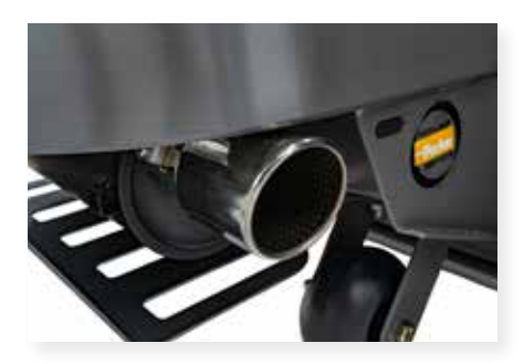
CHROME TIP EXHAUST