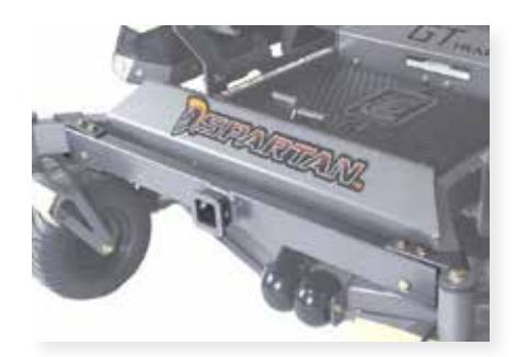
FRONT TUBE HITCH 493-0041-KT