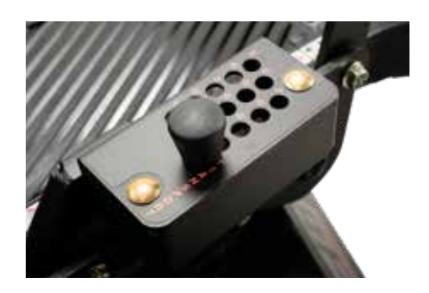
MAGNETIC PIN SYSTEM The magnetic mower height adjustment pin creates a quick access, easy to use system that gives you the perfect height cut every time.