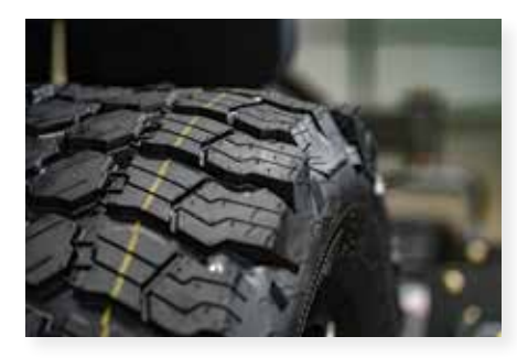
22" REAR RADIAL DRIVE TIRES These tires offer better ride with more compression ability on 10" rims.