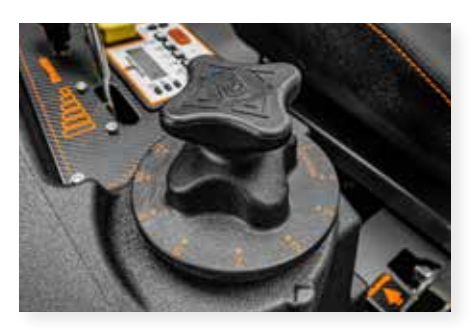
ON-THE-GO HEIGHT ADJUSTMENT DIAL RZ-Pro, RZ, and RZ-C deck height adjustments may be made on-the-go by depressing shock assisted pedal, dialing numbered level, and releasing pedal.