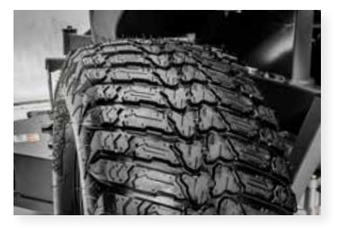
22" REAR TURF ARMOR TIRES Spartan exclusive tread design for improved traction both on level ground and on inclines.

Our key pad allows you to personalize your code to start the mower, has a push button switch for accessories, and the screen shows engine hours, PTO drive hours, when to change the oil and light indicators for diagnostics.