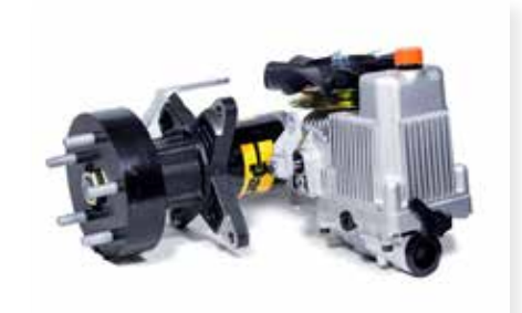
HYDRAULIC DRIVE 12CC & 10CC Keep your ride smooth and trouble-free with Parker all Hyraulic drives (no gear reduction and up to 25% more efficient than gear reduction hydros).