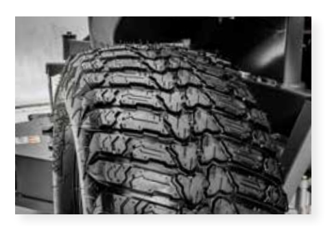
22" BIAS PLY TIRES Spartan exclusive tread design for improved traction both on level ground and on inclines. Large diameter tires roll over imperfections better.