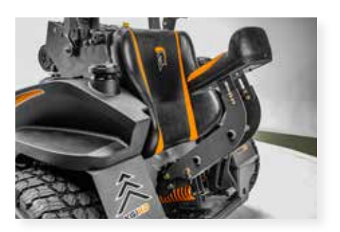
QUICK CHANGE SEAT Seat easily changed out in less than a minute but provides hours of comfort.