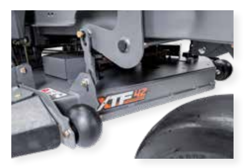
42" DECK Compact blade, 7-gauge, 4" deep deck will fit through gates, shed doors and onto smaller trailers.