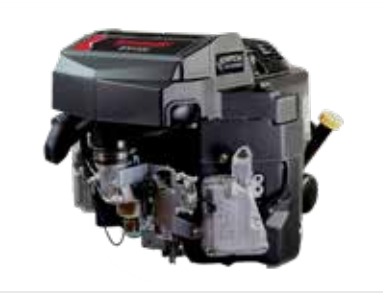
KAWASAKI FT730V 24 HP With 39.6 lbs-ft of torque, built to handle heavy loads. The Vortical air filtration system muscles out grass and debris while large, easy-toaccess integrated clean-out ports amp up efficiency and keep you cutting.