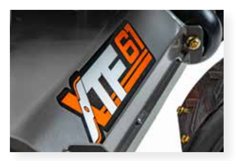
ENHANCED XTF DECK SYSTEM Xtreme Turf Flow (XTF) decks have been redesigned and enhanced to meet the spring, summer, and fall mowing conditions in 48 states. This enhanced deck system comes standard on ALL models 42" to 72".