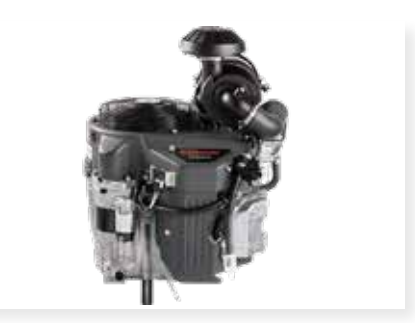
KAWASAKI FX1000V 35 HP 35 hp, 999cc, 56 lbs-ft torque, 138 lb, 3 valves per cylinder, heavy duty shift type starter, and multi stage air filter.