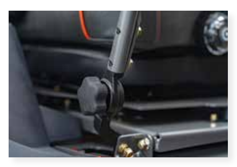
ADJUSTABLE STEERING ARMS Adjustable steering arms for all shapes and sizes of operators. *Standard on ALL KGZ, SRT, RT, and RZ-HD models.

Enclosed canister type air filter and fully pressurized oil system with screw-on filter, auto compression release, high efficiency oil cooler, and rotating grass chopper metal screen.