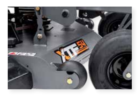
54" DECK Full 4", 7-gauge deck with triple blades cuts your grass like a dream and mowing time in half.