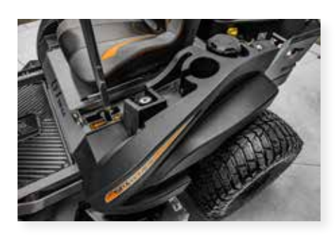
5 GAL FUEL TANK The sleek designed tank holds plenty of fuel for multiple small lot cuttings.

*Horsepower as rated by the engine manufacturer. As configured to meet safety, emission, and operating requirements, the actual engine horsepower on this mower may be lower.