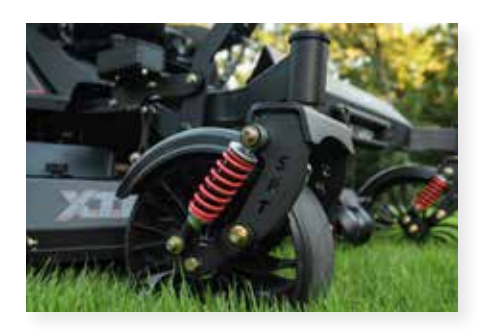
SUSPENSION FORKS Four shocked front spring suspension with multi adjustment create the smoothest ride possible.