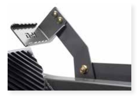
DECK HEIGHT FOOT PEDAL EXTENSION