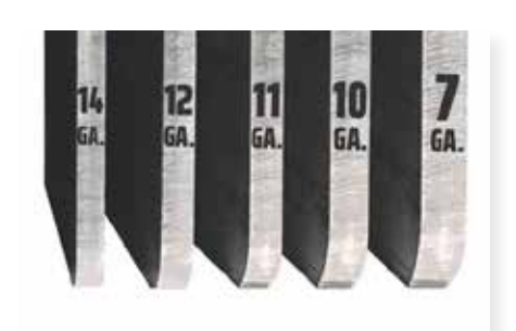
7-GAUGE STEEL DECK All Spartan Mowers have a deck fabricated from 7-gauge steel, not just the top end models. No light duty decks here!

requirements, the actual engine horsepower on this mower may be lower.