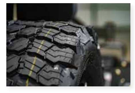
FRONT & REAR RADIAL TIRES Bumpy yards aren't a problem anymore with the smooth ride provided by the front and rear radial tires.

Keep your ride smooth and trouble-free with Parker all Hyraulic drives (no gear reduction and up to 25% more efficient than gear reduction hydros).