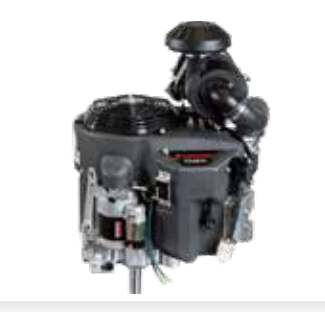
KAWASAKI FX801 25 HP Premium Commercial 852cc engine with 45.8 lbs/ft of torque. Expect major strength featuring cast iron cylinder liners, a metal engine cover, and HD shift type starters.

*Horsepower as rated by the engine manufacturer. As configured to meet safety, emission, and operating requirements, the actual engine horsepower on this mower may be lower.