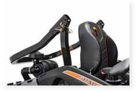
FOLDING ROPS RZ-HD and up models all come standard with folding ROPS. This allows loading in low enclosed trailers.