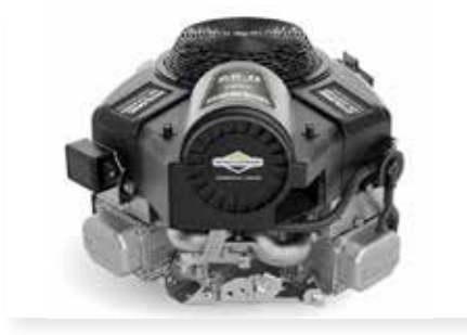
BRIGGS CXI 25 HP

5-Step debris management system and full pressure lubrication with spin-on oil filter for extended durability under heavy conditions.