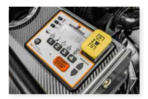
CONTROL PANEL Has soft start PTO switch and diagnostics such as RPM, oil change, job timer and more.

*Horsepower as rated by the engine manufacturer. As configured to meet safety, emission, and operating requirements, the actual engine horsepower on this mower may be lower.