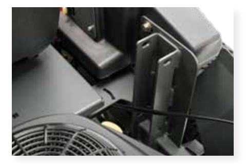
OPTIONAL FOLDING ROPS New for 2023, the RZ will have preset ROPS pockets for owners to add ROPS to if they prefer.

*All Spartan Mowers are equipped with multiple unique advantages, and subject to change at manufactureres discretion. Mower shown with additional options. See pages 5-8 to learn more.