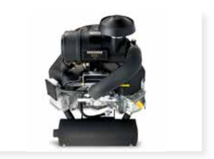
VANGUARD® BIG BLOCK 36 HP 125 lb Big Block engine designed to handle the most challenging applications with dependable engine power, performance and reliability.

KAWASAKI FX801V 25.5 HP 48.5 lbs/ft of torque and 125 lb weight have made this engine an industry standard. Grass chopper screen and HD shift type starter both reduce down time and ease starting.