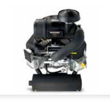
OIL GUARD SYSTEM The Vanguard Oil Guard system keeps oil cooler and allows 500 hours between oil changes instead of the standard 100.