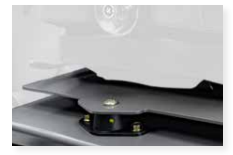
360 DEGREE SEAT PLATE Three neoprene mounting points absorb shock from 360 degrees.

Keep your ride smooth and trouble-free with Parker all Hyraulic drives (no gear reduction and up to 25% more efficient than gear reduction hydros). Who doesn't love being more efficient?