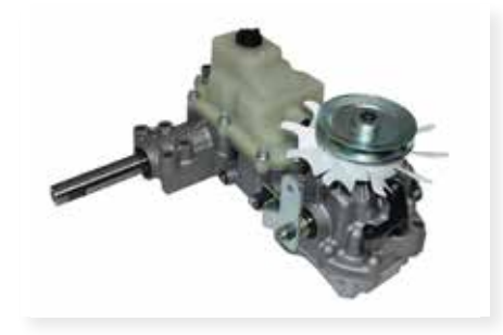
TUFF TORQ 400 DRIVE The Tuff Torq TZ-400 features heavy steel axles, reliable stopping power, aluminum case for durability, and easy maintenance.