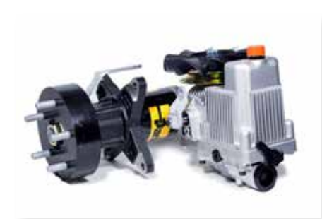
HYDRAULIC DRIVE 10CC HTE Keep your ride smooth and trouble-free with Parker all Hyraulic drives (no gear reduction and up to 25% more efficient than gear reduction hydros).

*Horsepower as rated by the engine manufacturer. As configured to meet safety, emission, and operating requirements, the actual engine horsepower on this mower may be lower.