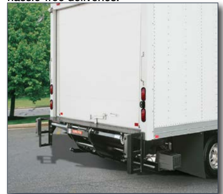
C Series Gate in stowed position.

Reduced maintenance and original Flipaway design means smoother, hassle-free deliveries.